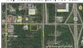
1161 E. Pontaluna Rd, Norton Shores