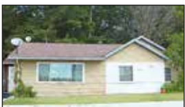
2090 Lake Avenue, Twin Lake