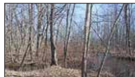
S. Dangi Road, Muskegon