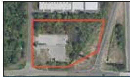
6550-6580 Schamber Dr, Norton Shores