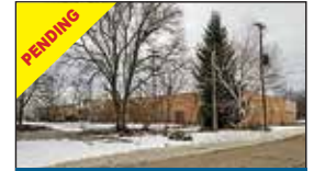
1938 Sanford, Muskegon