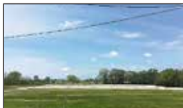
731 Yuba Street, Muskegon