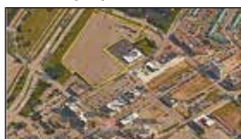
372 Morris Avenue, Muskegon