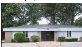
2155 W Sherman Blvd, Norton Shores