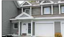
6698 Lakeshore Rd Unit 12, Manistee