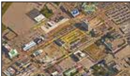
295-325 W. Western Ave, Muskegon