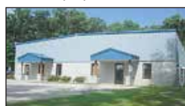
2357 Holton Rd, Muskegon