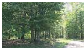
Forest Acres, Norton Shores