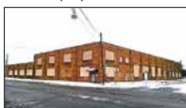
350 E. Broadway, Muskegon Heights