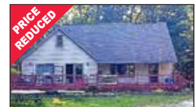
105 N. Mike Street, Fountain MI