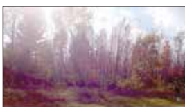
753 E. Porter Rd., Norton Shores