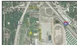
4769 S. Harvey St., Muskegon