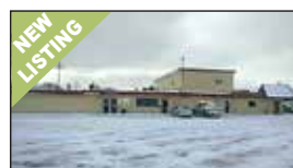
3162 Heights Ravenna Rd., Muskegon