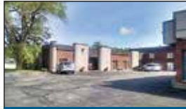
440 Whitehall Road, North Muskegon