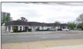
1 E. Apple Ave, Muskegon