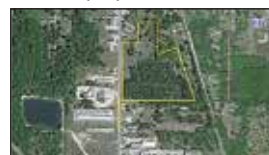
3270 Whitehall Road, Muskegon