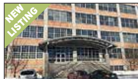
930 Washington Ave 3-F, Muskegon