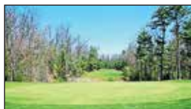
Darcliff Lane 101, Twin Lake