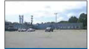
351 W. Laketon, Muskegon