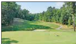
4121 Stone Valley Lane, Twin Lake