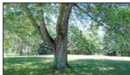
2350 Hughes Ave, Muskegon