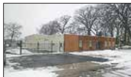
2225 Temple, Muskegon Hts.