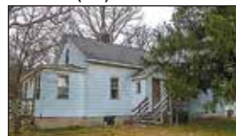
8959 Holton Rd, Holton, MI