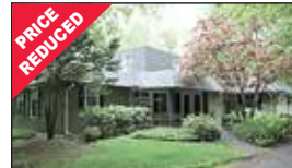
3162 N. Scenic Dr, Muskegon