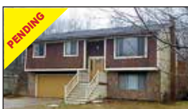
4681 S. Sheridan, Muskegon