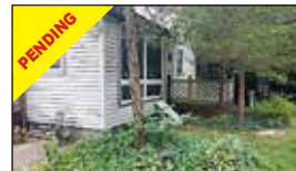
1681 Duck Lake Road, Muskegon