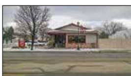
213 W. Savidge, Spring Lake