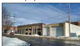
1150 7th St. Muskegon