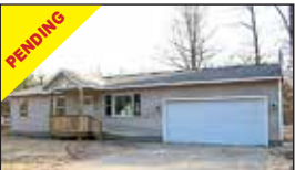
6617 Evanston Ave, Muskegon