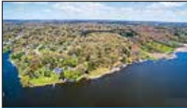
1217 Dykstra, Laketon Twp, Muskegon