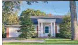
1637 Ruddiman Dr, North Muskegon