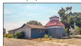
1113 Ruddiman, North Muskegon