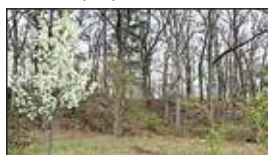
2301 View Lane, N. Muskegon