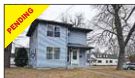
326 Sumner Ave, Muskegon