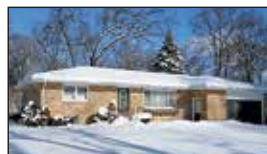
1636 Kregel Ave, Muskegon