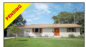
2200 Moulton, N. Muskegon