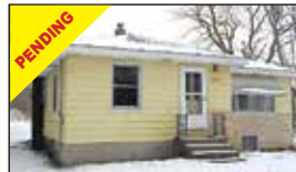
4558 Blackmer Rd, Ravenna