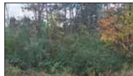
1309 Water Pointe Ct., Whitehall