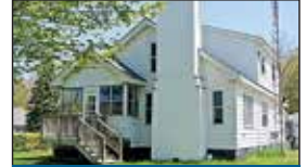
5212 Henry St, Muskegon