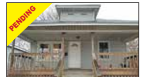
1062 Laketon Ave, Muskegon