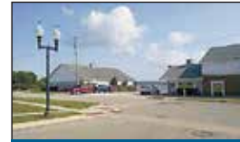
200 River St., Manistee