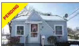
403 First St, North Muskegon