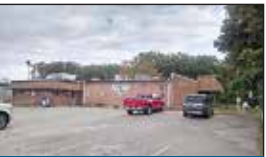
165 S. Getty, Muskegon