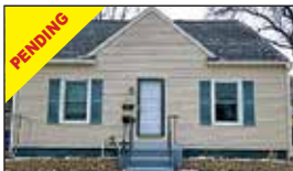
3020 Roosevelt Rd, Muskegon