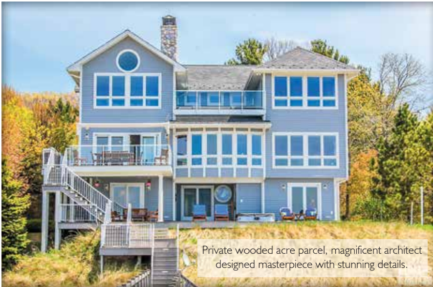
Private wooded acre parcel, magnificent architect designed masterpiece with stunning details.

LAKE MICHIGAN frontage architect designed contemporary showcase home. 6700 sq. ft., 6 bedrooms, 4.5 baths. Magnificent open floor plan, impeccably maintained & organized for comfort & relaxation. Amenities & quality abound. Breathtaking Lake views & sunsets. 3 levels plus a full basement (great workshop) and elevator for convenience. 3 stall attached heated garage with tiled floor. Located in picturesque Timber Dunes near Benona Shores Golf Course, SHELBY. $1,895,000.