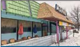
1811 W Sherman Blvd.