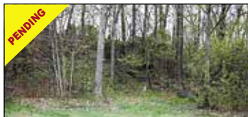
View Lane | N. Muskegon $14,000-$18,000