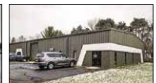
1730 Airpark Dr A Grand Haven | $3.80 SF