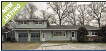
927 Victor Avenue Muskegon | $159,900