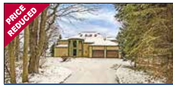
3225 Memorial Dr Muskegon | $549,000