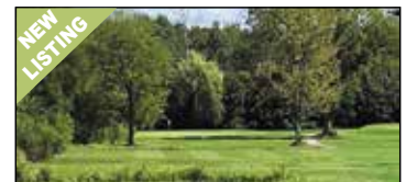
2480 Duck Lake Rd Whitehall | $449,900