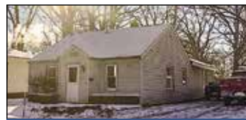
1337 Langeland Ave Muskegon | $64,900