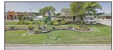
901 S. Beacon Blvd Grand Haven | $949,000