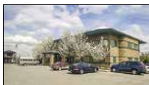
3587 Henry St. Units A & B Muskegon | $14 SF