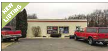
5270 E Apple Ave Muskegon | $199,000