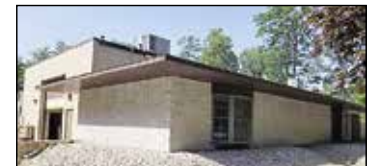
5145 Industrial Park Drive Montague | $269,000