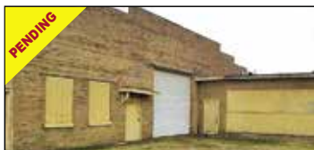
1208 8th Street Muskegon | $250,000