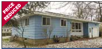
545 Harold St Muskegon | $119,900