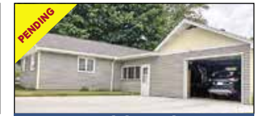
5661 Richmond Ave Muskegon | $114,900