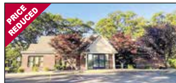
268 Seminole Norton Shores | $599,000

Bryan Bench (231) 578-2508 Troy Wasserman 231-750-9627