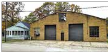
1099 Gordon Street Muskegon | $249,000