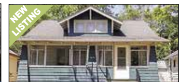
1845 Manz St Muskegon | $54,900