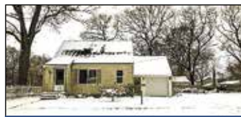
683 School Street Muskegon | $110,000