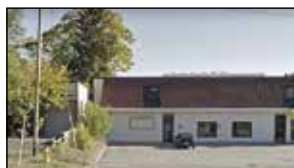
420 Whitehall Road N. Muskegon | $12 SF