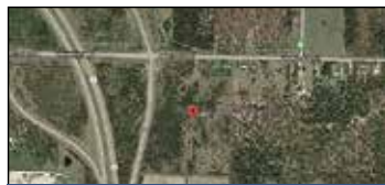
3651 W Winston Rd Rothbury | $150,000