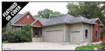
4223 Locksley Lane Twin Lake | $289,900