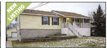
2467 Vine Ave Muskegon | $164,900