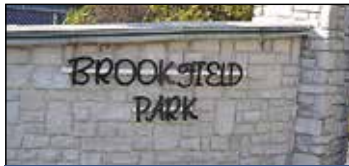
0 Brookfield Park Spring Lake | $60,000