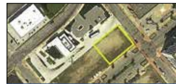
292 W Western, Muskegon $119,000 & $199,000