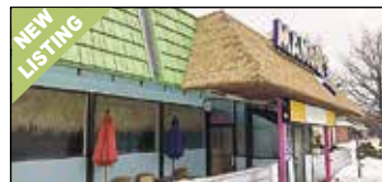
1811 W Sherman, Muskegon $369,900/$10.93SF