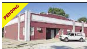
309 S. Jackson Ave Muskegon | $25,000