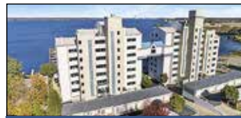
2964 Lakeshore Dr E103 Muskegon | $264,900