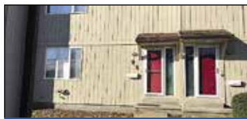
1368 W Norton Ave #6 Muskegon | $109,900