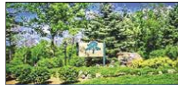
Stonegate Properties Twin Lake | $27,900-$39,900