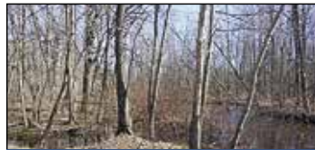
S. Dangi Road Muskegon | $39,900

Maureen Duff 231-638-3836 Hunter Rogers 231-670-4788