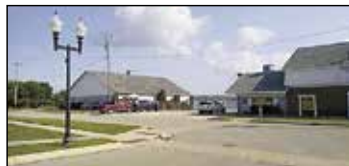
200 River Street Manistee | $1,850,000