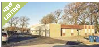
2225 Temple St Muskegon Heights | $450,000