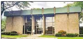
3145 Henry Street Muskegon | $850,000