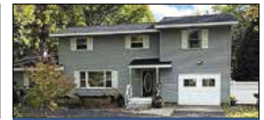
5491 Hts. Ravenna Road Fruitport | $309,000