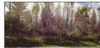
753 E. Porter Road Norton Shores | $77,000

Tom Sanocki 231-375-5271 Core Realty Partners 231-375-5273