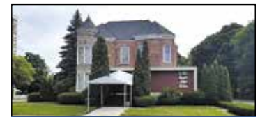
1102 Terrace and 77 Hartford Muskegon | $19K - $199K