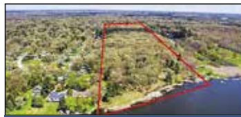
1217 Dykstra Laketon Twp | $599,000