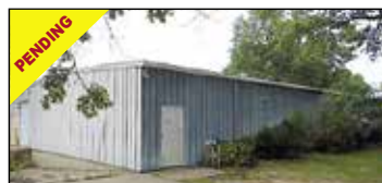
2541 Park Street Muskegon Heights | $85,000