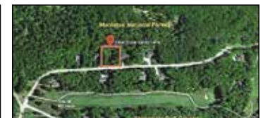
3964 Stone Valley Drive Twin Lake | $39,900