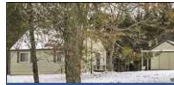
2974 E 56th Street Chase | $130,000