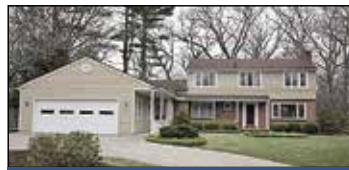
423 E Circle Drive North Muskegon | $269,000