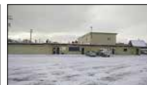
3162 Heights Ravenna Rd Muskegon | $8.56-$11.00 SF