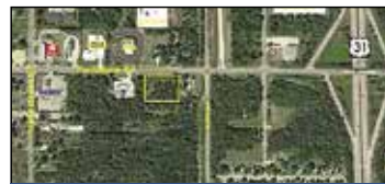
1161 E. Pontaluna Road Norton Shores | $279,000