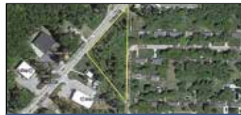
0 Holton Road Muskegon | $199,000