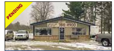
4515 E Apple Ave Muskegon | $159,900