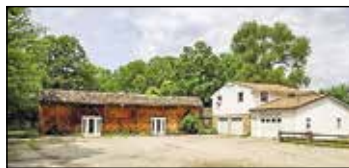
836 Dykstra Muskegon | $199,000