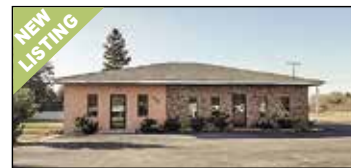
2999 Whitehall Rd Muskegon | $184,900