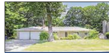
3908 Applewood Lane Norton Shores | $239,900