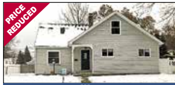
1313 Mills Avenue North Muskegon | $135,900