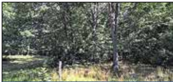
Forest Acres, Norton Shores $130,000 to $170,000