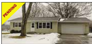
2107 N Sheridan Drive Muskegon | $184,900