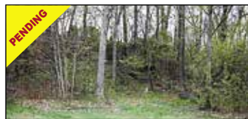
View Lane | N. Muskegon $14,000-$18,000