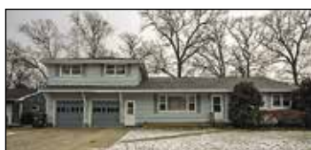
927 Victor Avenue Muskegon | $159,900