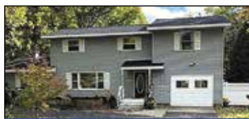
5491 Hts. Ravenna Road Fruitport | $309,000