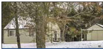
2974 E 56th Street Chase | $130,000

Core Realty Partners is equipped with a team of licensed and highly experienced professionals that would love to assist you in your journey! Our team is committed to providing the utmost professional and efficient services! Here at Core Realty Partners , we work by YOU , with YOU , and for YOU !