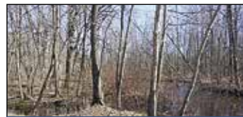
S. Dengl Road Muskegon | $39,900

Maureen Duff 231-638-3836 Hunter Rogers 231-670-4788