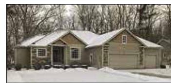
872 Bear Lake Road Muskegon | $324,900

Vivian Keene 231-638-1972 Char Kurant 231-750-8937