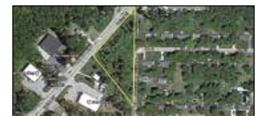
0 Holton Road Muskegon | $199,000