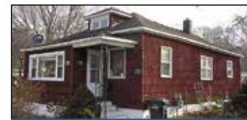
1728 Division Street Muskegon | $59,900