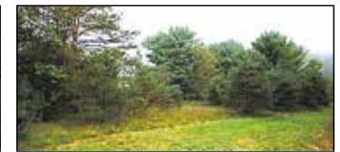
0 Ryerson | Twin Lake $19,900

Troy Wasserman 231-750-9627 Bryan Bench 231-578-2508