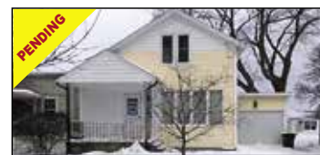
1378 Lakeshore Dr Muskegon | $214,900