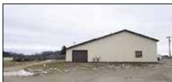
3904 Blue Star Hwy Holland | $549,000