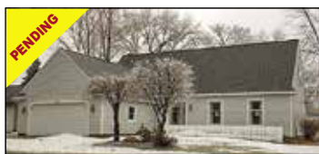
3216 Rockland Road Muskegon | $199,900