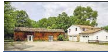
836 Dykstra Muskegon | $199,000