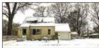
683 School Street Muskegon | $110,000