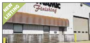
476 W Sherman Blvd Muskegon Heights | $329,000