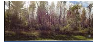
753 E. Porter Road Norton Shores | $77,000

Troy Wasserman 231-750-9627 Bryan Bench 231-578-2508