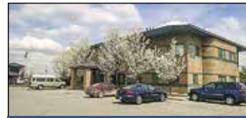
3587 Henry St Units A, B & C Muskegon | $14 SF