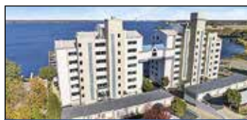
2964 Lakeshore Dr E103 Condo | $264,900