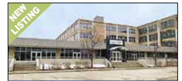
930 Washington Ave Muskegon | $8-$10.50 SF