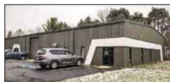
1730 Airpark Dr A Grand Haven | $3.80 SF