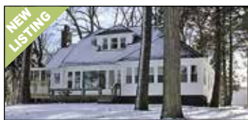
832 Oakmere North Muskegon | $680,000