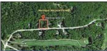
3964 Stone Valley Drive Twin Lake | $39,900