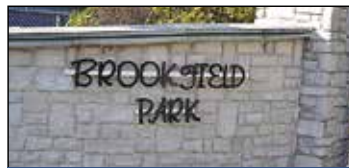
0 Brookfield Park Spring Lake | $60,000

Tom Sanocki 231-375-5271 Hunter Rogers 231-670-478 Maureen Duff 231-638-3836