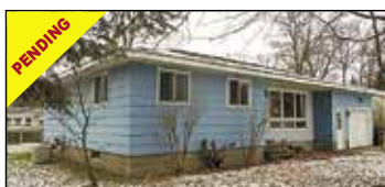
545 Harold St Muskegon | $119,900