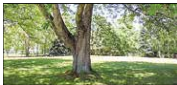
2350 Hughes Muskegon | $19,000