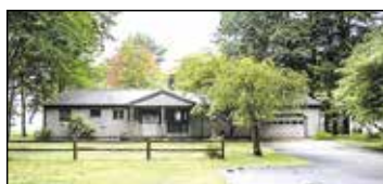
1309 Scenic Drive Muskegon | $849,900