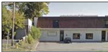
420 Whitehall Road N. Muskegon | $12 PER SQFT