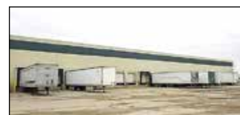
1450 E Laketon Ave A-E Muskegon | $2.90SF-$3.25SF