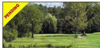
2480 Duck Lake Rd Whitehall | $449,900