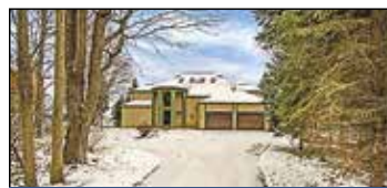
3225 Memorial Dr Muskegon | $525,000