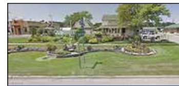
901 S. Beacon Blvd Grand Haven | $949,000