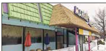
1811 W Sherman, Muskegon $369,900/$10.93SF