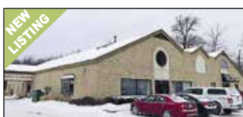
917 W Norton Ave Norton Shores | $10-$14 SF