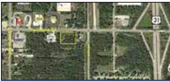
1161 E. Pontaluna Road Norton Shores | $229,000