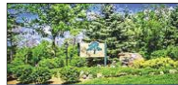
Stonegate Properties Twin Lake | $27,900-$39,900