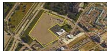
372 Morris Avenue Muskegon | $1,200,000