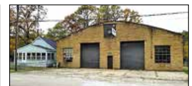
1099 Gordon Street Muskegon | $249,000