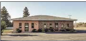
2999 Whitehall Road Muskegon | $184,900