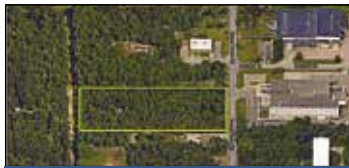
6905 Grand Haven Road Spring Lake | $165,000