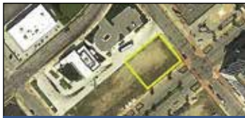
292 W Western, Muskegon $119,000 & $199,000