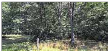
Forest Acres, Norton Shores $130,000 to $170,000