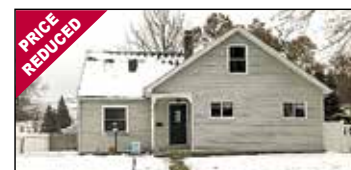
1313 Mills Avenue North Muskegon | $130,000