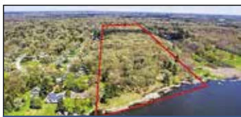
1217 Dykstra Laketon Twp | $599,000