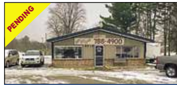
4515 E Apple Ave Muskegon | $159,900