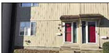
1368 W Norton Ave #6 Muskegon | $109,900