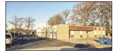
2225 Temple Street Muskegon Heights | $450,000