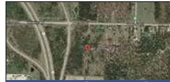
3651 W Winston Road Rothbury | $150,000