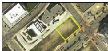
292 W Western, Muskegon $119,000 & $199,000