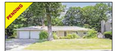
3908 Applewood Lane Norton Shores | $239,900