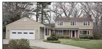
423 E Circle Drive North Muskegon | $269,000