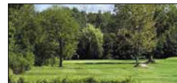
2480 Duck Lake Rd Whitehall | $449,900