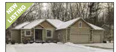
872 Bear Lake Road Muskegon | $324,900