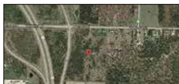
3651 W Winston Road Rothbury | $150,000