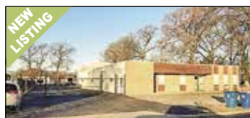
2225 Temple Street Muskegon Heights | $450,000