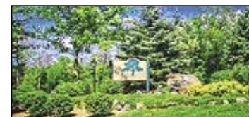
Stonegate Properties Twin Lake | $27,900-$39,900