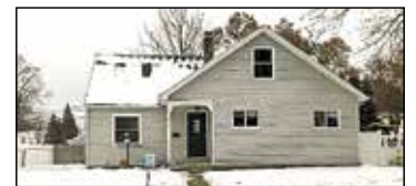
1313 Mills Avenue North Muskegon | $135,900