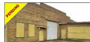
1208 8th Street Muskegon | $250,000