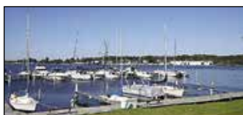
Little Harbor Yacht Club Marina | $429,000