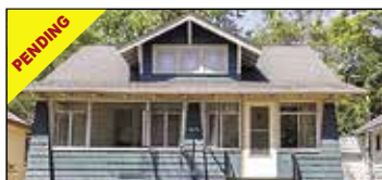
1845 Manz St Muskegon | $54,900