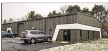
1730 Airpark Dr A Grand Haven | $3.80 SF