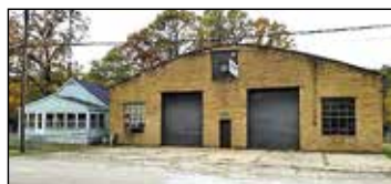
1099 Gordon Street Muskegon | $249,000