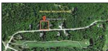
3964 Stone Valley Drive Twin Lake | $39,900