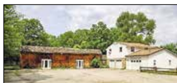
836 Dykstra Muskegon | $199,000