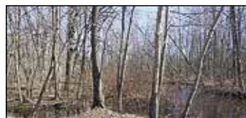
S. Dengl Road Muskegon | $39,900

Maureen Duff 231-638-3836 Hunter Rogers 231-670-4788