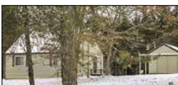
2974 E 56th Street Chase | $130,000