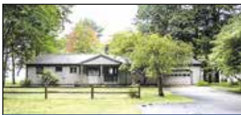
1309 Scenic Drive Muskegon | $849,900