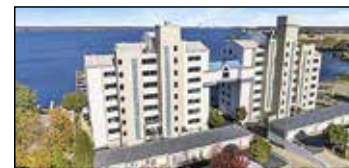
2964 Lakeshore Dr E103 Muskegon | $264,900