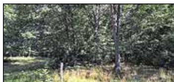
Forest Acres, Norton Shores $130,000 to $170,000