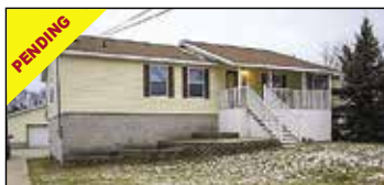
2467 Vine Ave Muskegon | $164,900