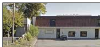
420 Whitehall Road N. Muskegon | $12 PER SQFT