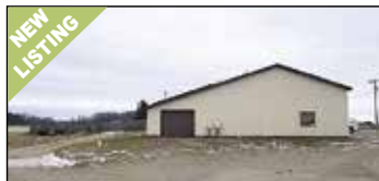
3904 Blue Star Hwy Holland | $549,000