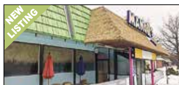
1811 W Sherman, Muskegon $369,900/$10.93SF