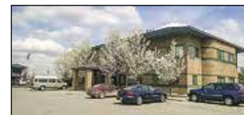
3587 Henry St Units A, B & C Muskegon | $14 SF