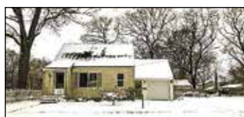
683 School Street Muskegon | $110,000