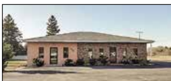
2999 Whitehall Road Muskegon | $184,900