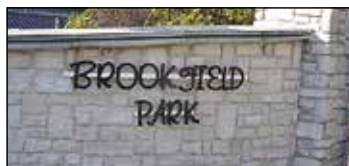
0 Brookfield Park Spring Lake | $60,000