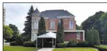
1102 Terrace and 77 Hartford Muskegon | $19K - $199K