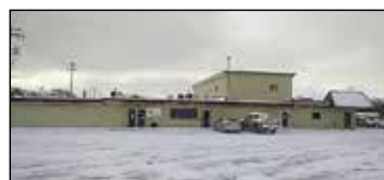
3162 Heights Ravenna Road Muskegon | $8.56-$11.00 SF