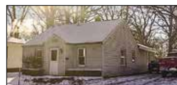
1337 Langeland Ave Muskegon | $64,900