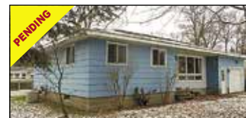
545 Harold St Muskegon | $119,900