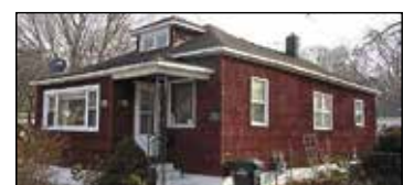
1728 Division Street Muskegon | $59,900