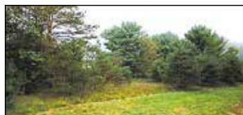
0 Ryerson | Twin Lake $19,900

Troy Wasserman 231-750-9627 Bryan Bench 231-578-2508