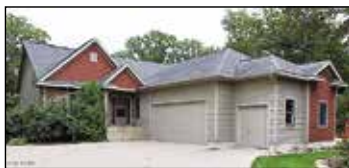
4223 Locksley Lane Twin Lake | $289,900