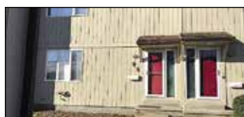
1368 W Norton Ave #6 Muskegon | $109,900