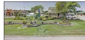
901 S. Beacon Blvd Grand Haven | $949,000