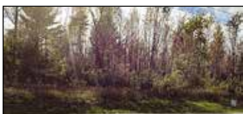
753 E. Porter Road Norton Shores | $77,000

Troy Wasserman 231-750-9627 Bryan Bench 231-578-2508