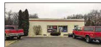
5270 E Apple Ave Muskegon | $199,000