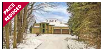
3225 Memorial Dr Muskegon | $525,000