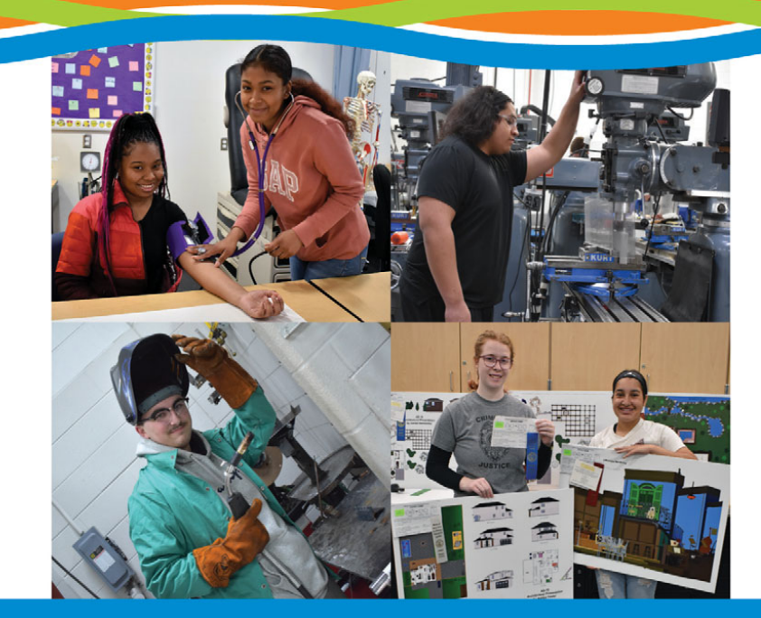
READY TO ACCELERATE YOUR CAREER? See your counselor to enroll. muskegonctc.org